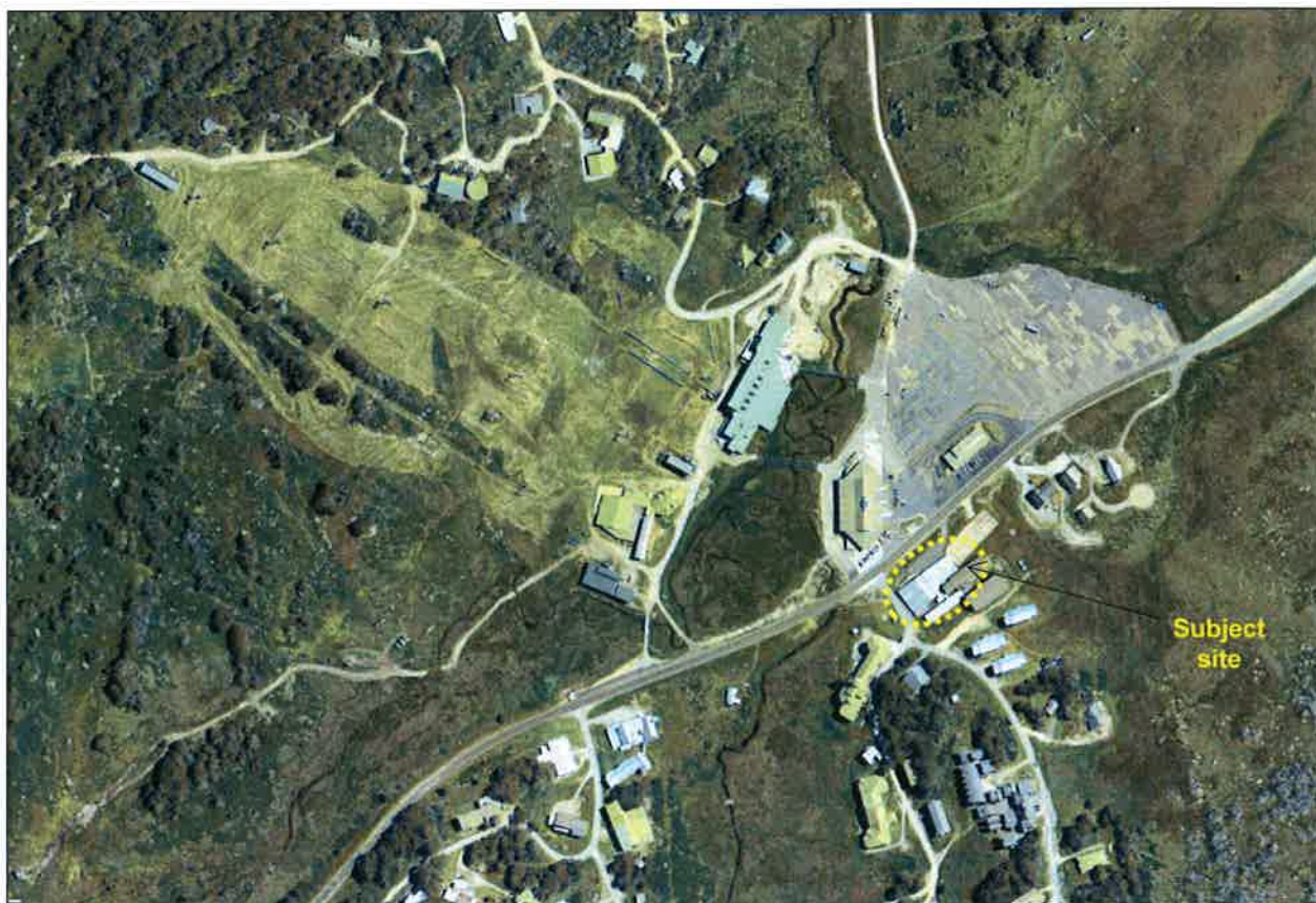
Figure 1: Site Location in context to Perisher Valley

Established in 1960, the Hotel provides accommodation and restaurant / entertainment facilities within close proximity to Front Valley at Perisher.